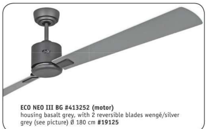
ECO NEO III BG #413252 (motor) housing basalt grey, with 2 reversible blades wengé/silver grey (see picture) Ø 180 cm #19125