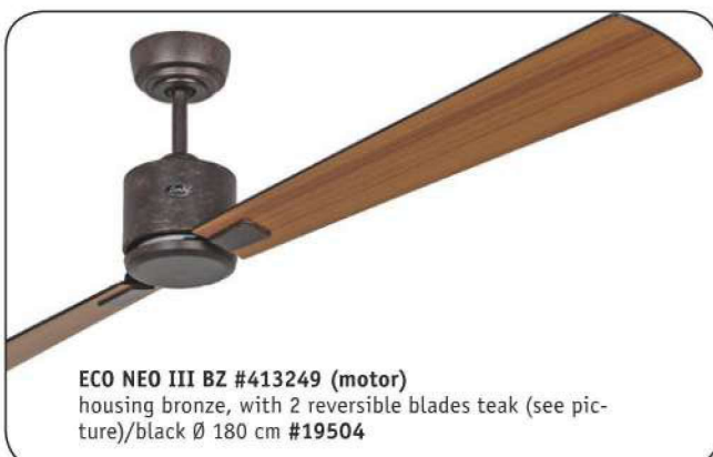
ECO NEO III BZ #413249 (motor) housing bronze, with 2 reversible blades teak (see picture)/black Ø 180 cm #19504