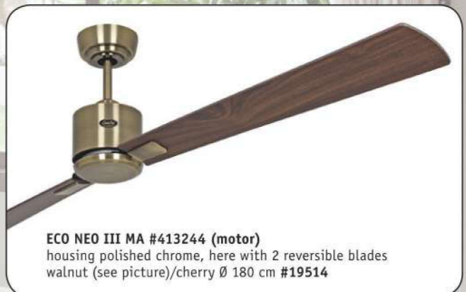
ECO NEO III MA #413244 (motor) housing polished chrome, here with 2 reversible blades walnut (see picture)/cherry Ø 180 cm #19514