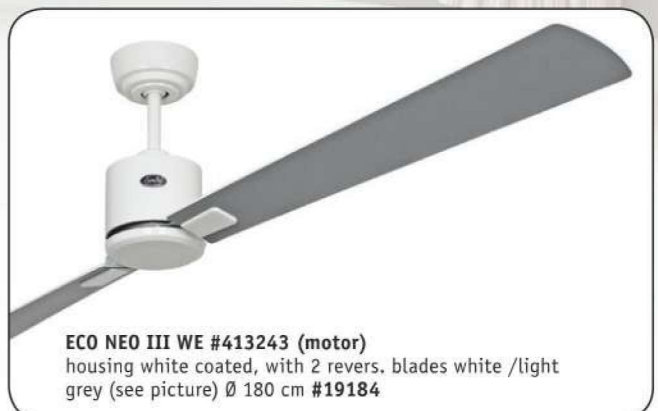
ECO NEO III WE #413243 (motor) housing white coated, with 2 revers. blades white /light grey (see picture) Ø 180 cm #19184