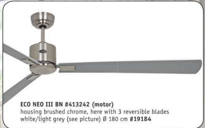
ECO NEO III BN #413242 (motor) housing brushed chrome, here with 3 reversible blades white/light grey (see picture) Ø 180 cm #19184